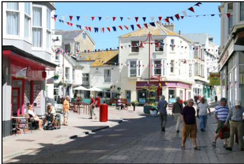
Seaton Town Centre